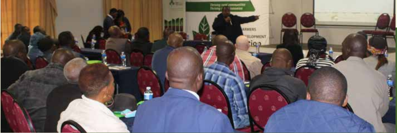
Abalimi baseMpumalanga ngesikhathi bethamele inkomfa ebiqhubeka

Inhlangano yabalimi bakamoba (South African Farmers Development Association) isingathe inkomfa yezinsuku ezimbili esifundazweni saseMpumalanga nokwakudingidwa kabanzi ngezinselo ezibhekene nabantu asebabuyelwa umhlaba wabo kodwa abawusebenzisa ngaphansi kwemigomo nemibandela yabalingani babo esiFundazweni iMpumalanga nagecina asebashiya becwile ezikweletini futhi bengenzi nzuzo ngomhlaba wabo.