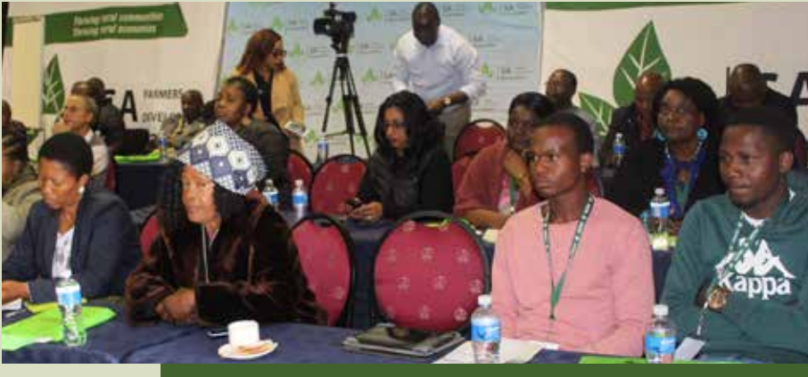
Abalimi ngesikhathi belalele izinkulumo kwiNkomfa ebebeyithamele