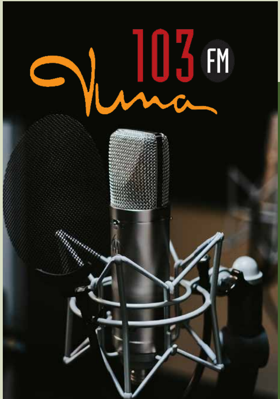
Vuma FM logo