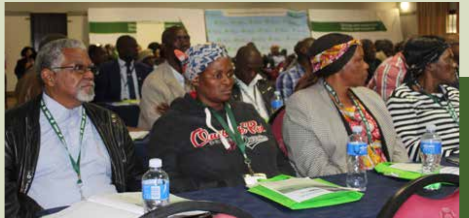
Abalimi ngesikhathi belalele izinkulumo kwiNkomfa ebebeyithamele

-ukubusa kokuphatha komhlaba, izinhlelo zamabhizinisi kanye nokuthuthuka komphakathi.