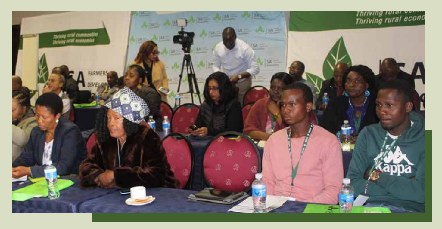
Growers listening to Presentations as the conference was in progress