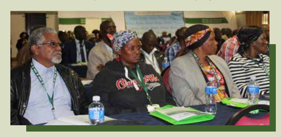
Growers listening to Presentations as the conference was in progress