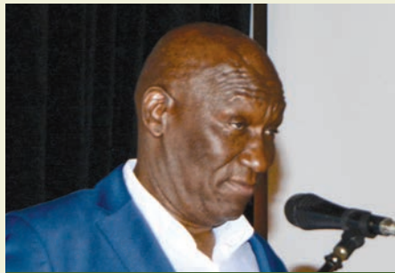
Bheki Cele Former Deputy of Agriculture Forestry and Fisheries