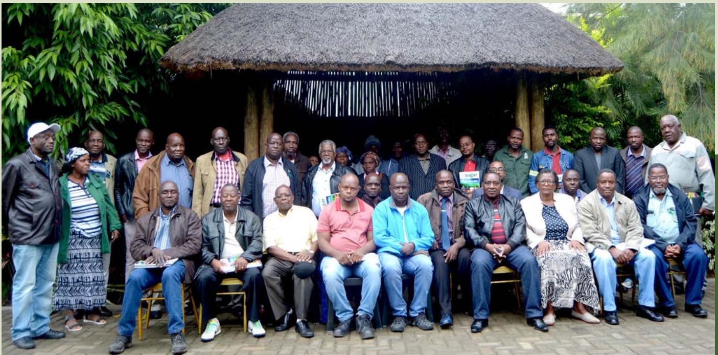
Izithunywa ezazihamabele umhlangano wokukhethwa kobuholi base-Mpumalanga be SAFDA

NgoLwesihlanu 23 March balimi abangamalungu eSAFDA eMpumalanga akhetha ubuholi bawo besifundazwe. Ithimba lobuholi elakhiwe ngamalungu angu-15 lakhiwe ngabamele abalima ngokuncane kanye nabalimi bezokubuyiselwa komhlaba baseKomati naseMalalane. I-SAFDA ikuthokozela kakhulu ukuthi yonke imiphakathi engu-