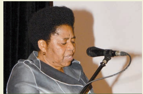
Candith Mashego-Dlamini Deputy Minister of Rural Development and Land Reform